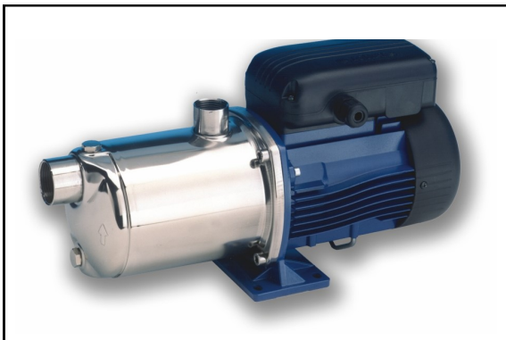
Lowara e-HM pump