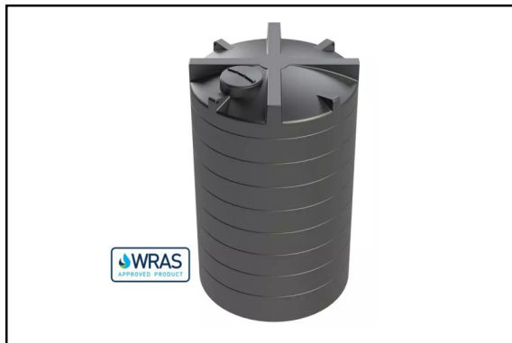
WRAS approved 30,000 litre storage tank